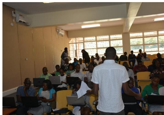
Training REC administrators and IT personnel at the Busitema main Campus

The project implemented by UNCST and partners; Busitema University and Mbale Regional Referral Hospital is building on the achievements of CREU with a view to making UNCST a centre of excellence for research ethics in the Eastern Africa region. It has trained 25 RECs on the use of NRIMS, online review and equipped them RECs with the requisite equipment and Internet connectivity. Through the training programme, SCRECU has empowered the REC institutions and other stakeholders with well-qualified REC administrators through capacity building and skills.